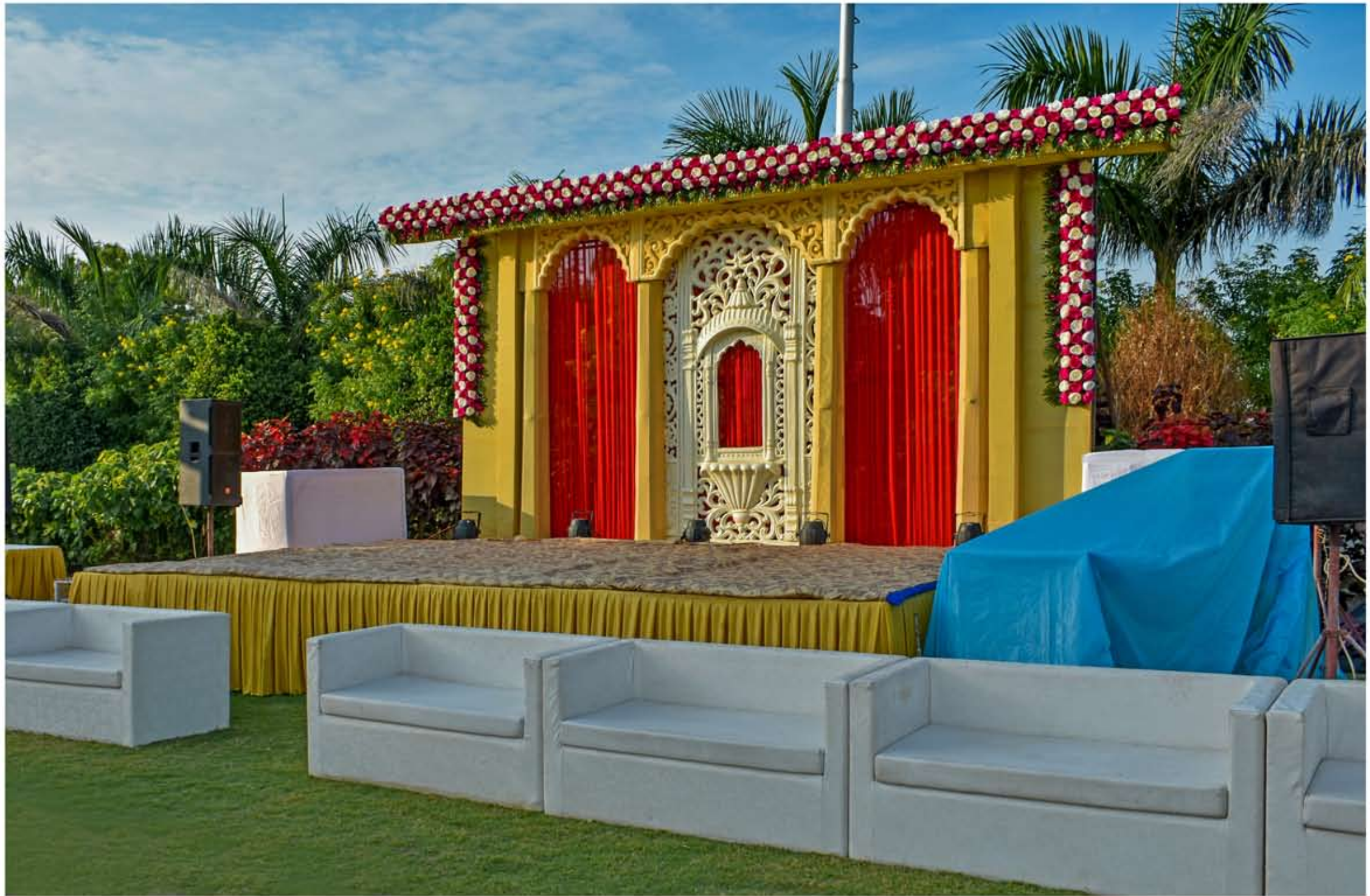
❧ ❧ ❧ Sangeet Stage ❧ ❧ ❧