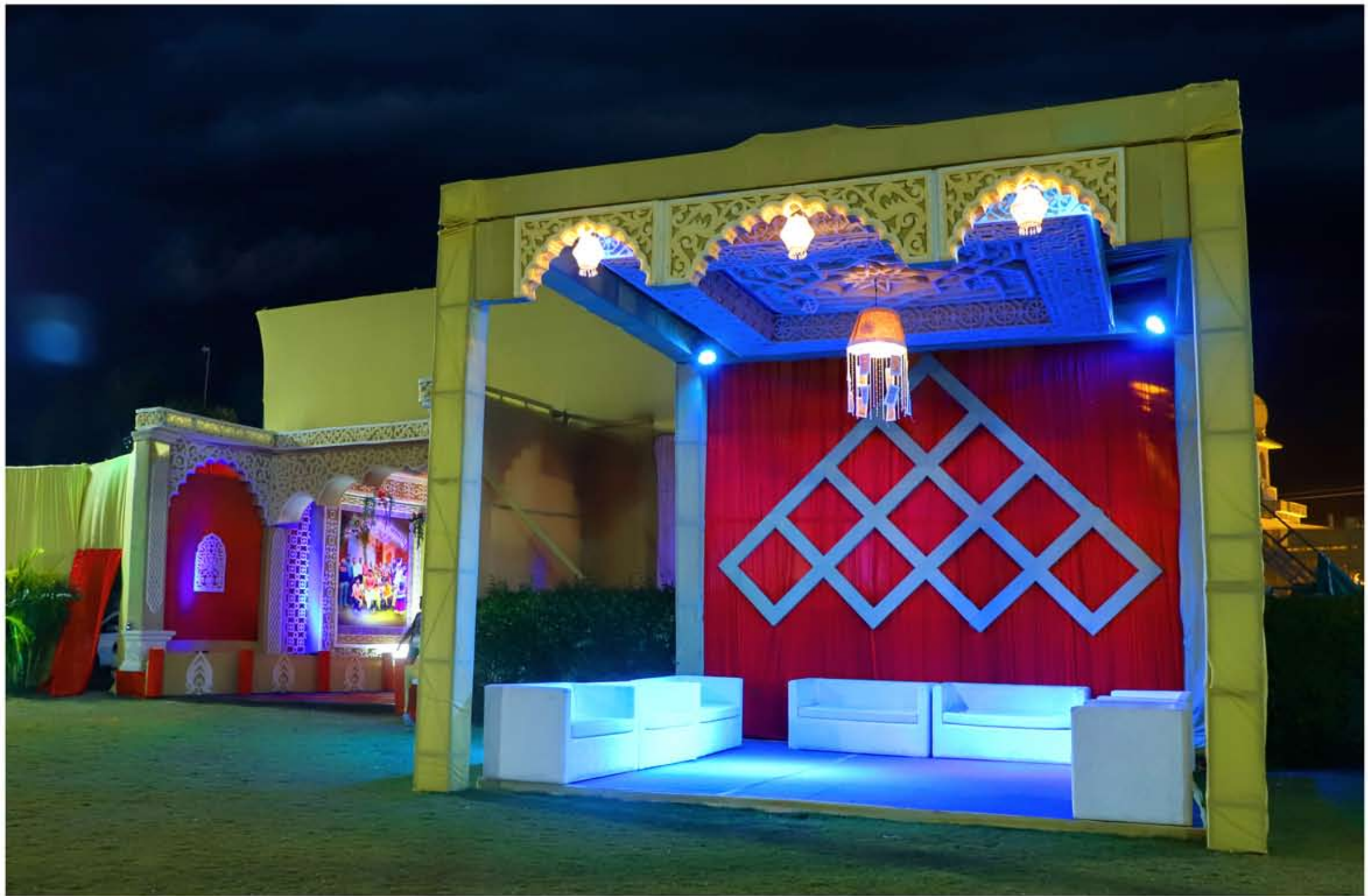
... Gazebo ...