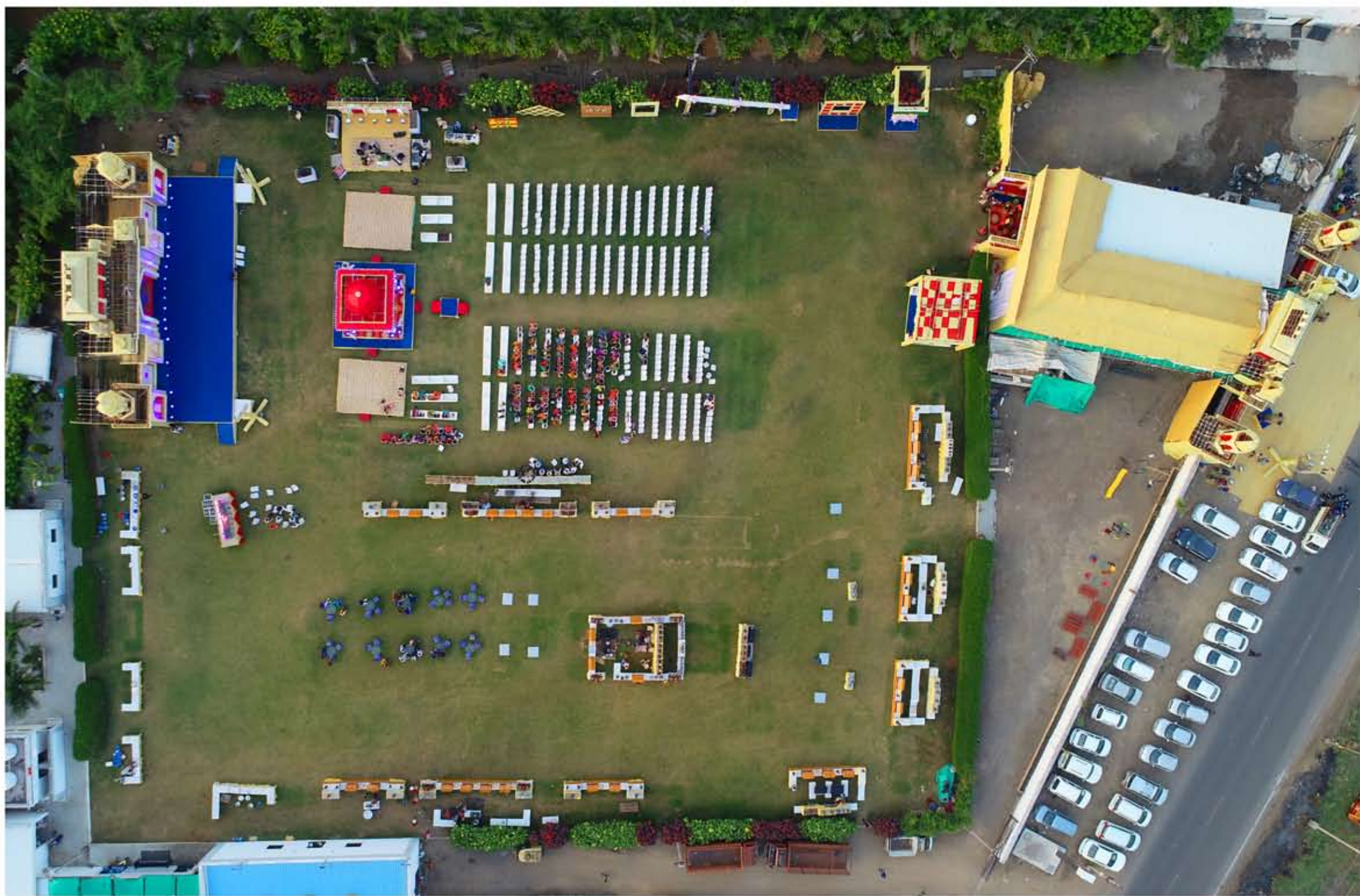
Party Plot View