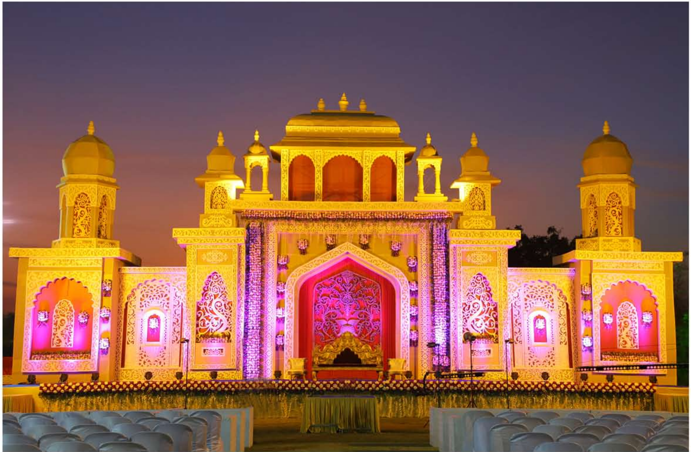
... Reception Stage ...